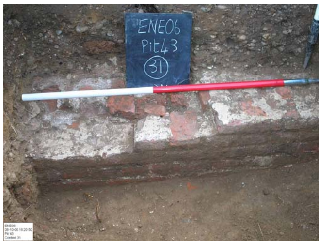
Fig 2: Wall in P43 looking west

Further north though where buildings clearly lay at the edge of the courtyard the one construction encountered was undoubtedly a massive Tudor wall. Here, in P43, we excavated four or five courses of a probably greater surviving number of a north south wall, over 39 cm thick (its western face not being within the pit) (Fig. 2). It was built of well laid 23x11x5.5 cm, hand made, hard fired, unfrogged, red bricks and hard white mortar in English bond and its eastern face had struck joints. There were possible signs of slightly less regular bonding to the core but it remained very structurally sound and major tree roots had failed to disturb it, diverting along/across its upper surface. Resistivity surveys in this area (Fig. 1) show this and other probable walls running on two alignments and a plausible interpretation is that here a courtier's palace structure was demolished and replaced, or at least significantly modified.