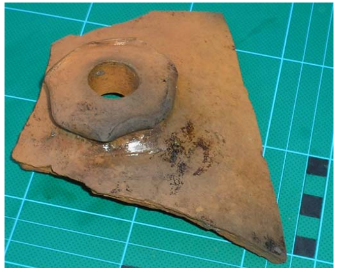
Fig 3: Part of a bung holed jar or cistern from the middens in P35

indicated including an unusual octagonal salt, a porringer, mug(s), small jars, chargers and bowls, many decorated in blue and sometimes other colours.