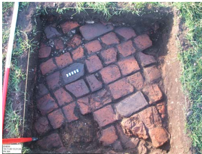
Fig 3: Brick floor in P38A

three rooms, one now with a tree (Y316) growing within it, at this ground level to judge from resistivity evidence (though its south wall is inobvious), was probably of late 15 th century origin as soft, sandy, this time cream mortar was common in demolition material in the area along with harder white and pinky mortars.